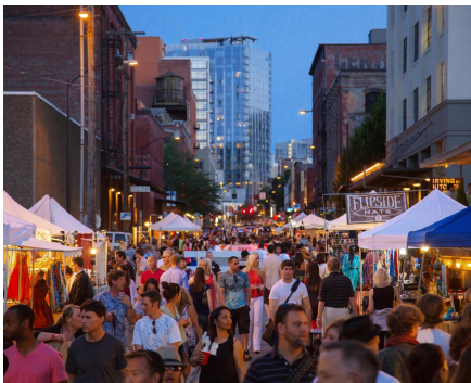
Thursday Art Festival