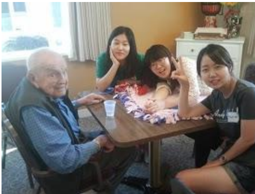
Elderly Community Activity