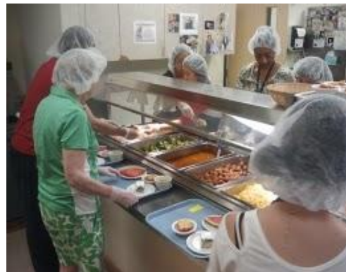
Homeless Soup Kitchen / Hunger Activity